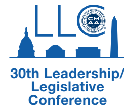
Leadership/Legislative Conference (LLC) (New Design Annually)