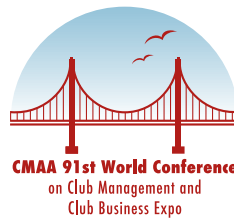
CMAA World Conference and Club Business Expo (New Design Annually)