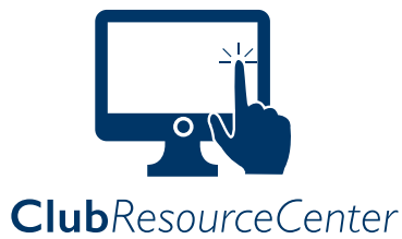
Club Resource Center