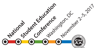
National Student Education Conference (New Design Annually)